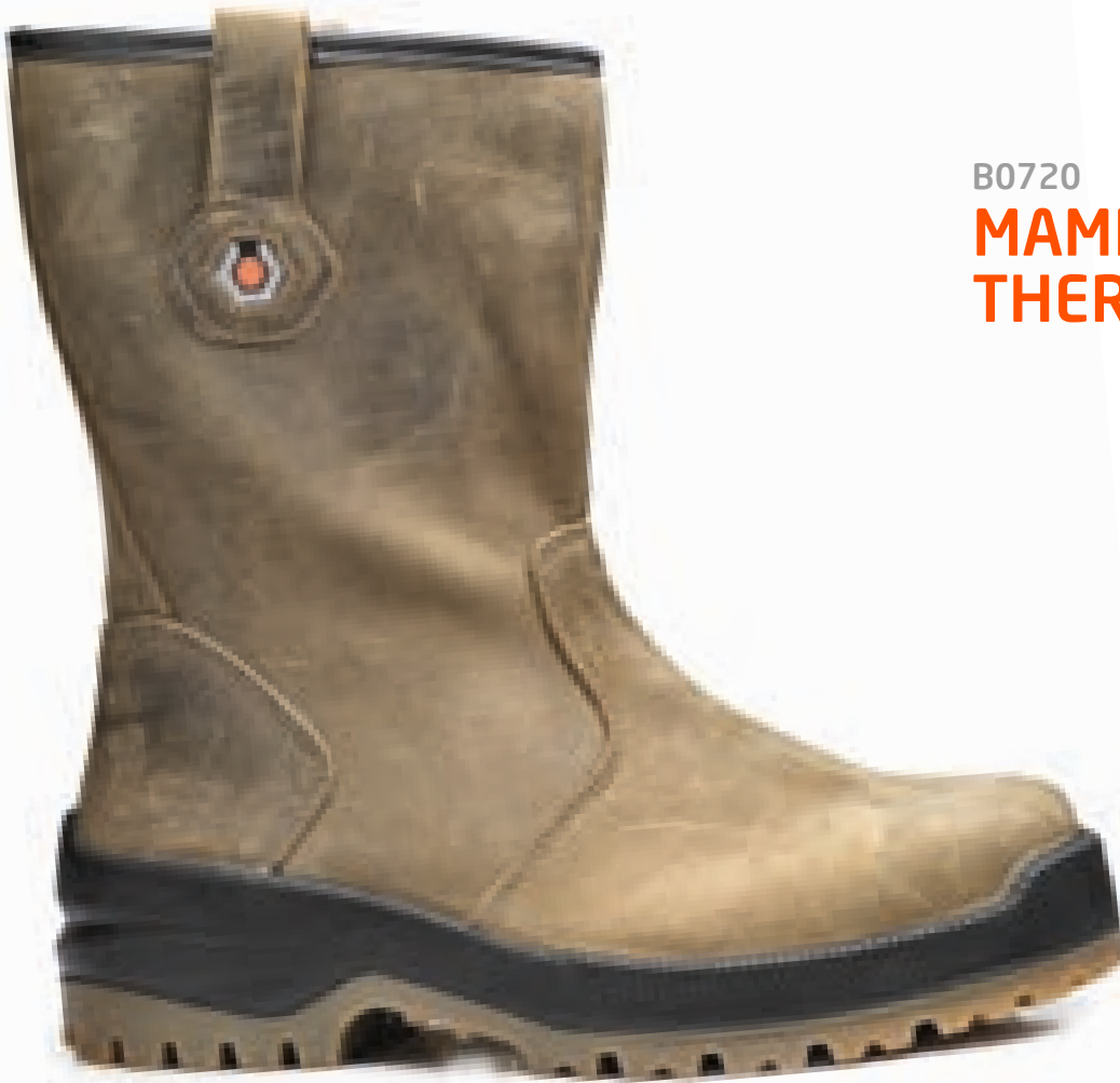
B0720 MAMMUTH THERMO